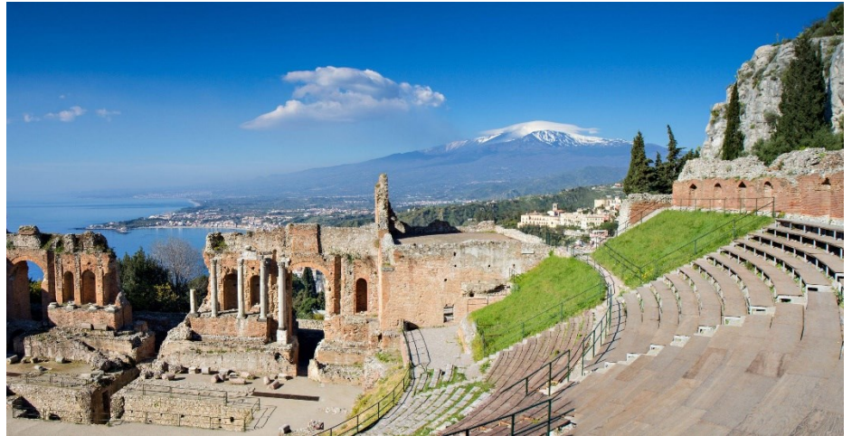
Sicily: A Masterpiece Wrought by God Himself